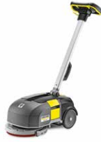
BD 30/4 C BP