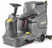
BD 50/70 R BP