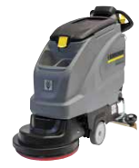
B 40 W WITH D 51 HEAD