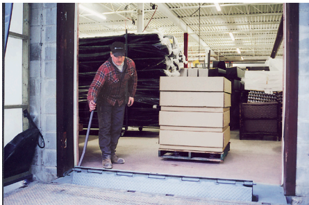
Torsion spring assist and integrated handle result in low effort activation.