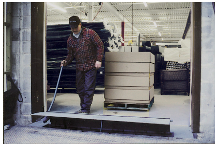
The edge of dock lip automatically locks as the deck is extended.