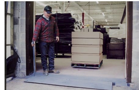
Safety is enhanced through less operational effort. Increased convenience and safer than aluminum dock plates.