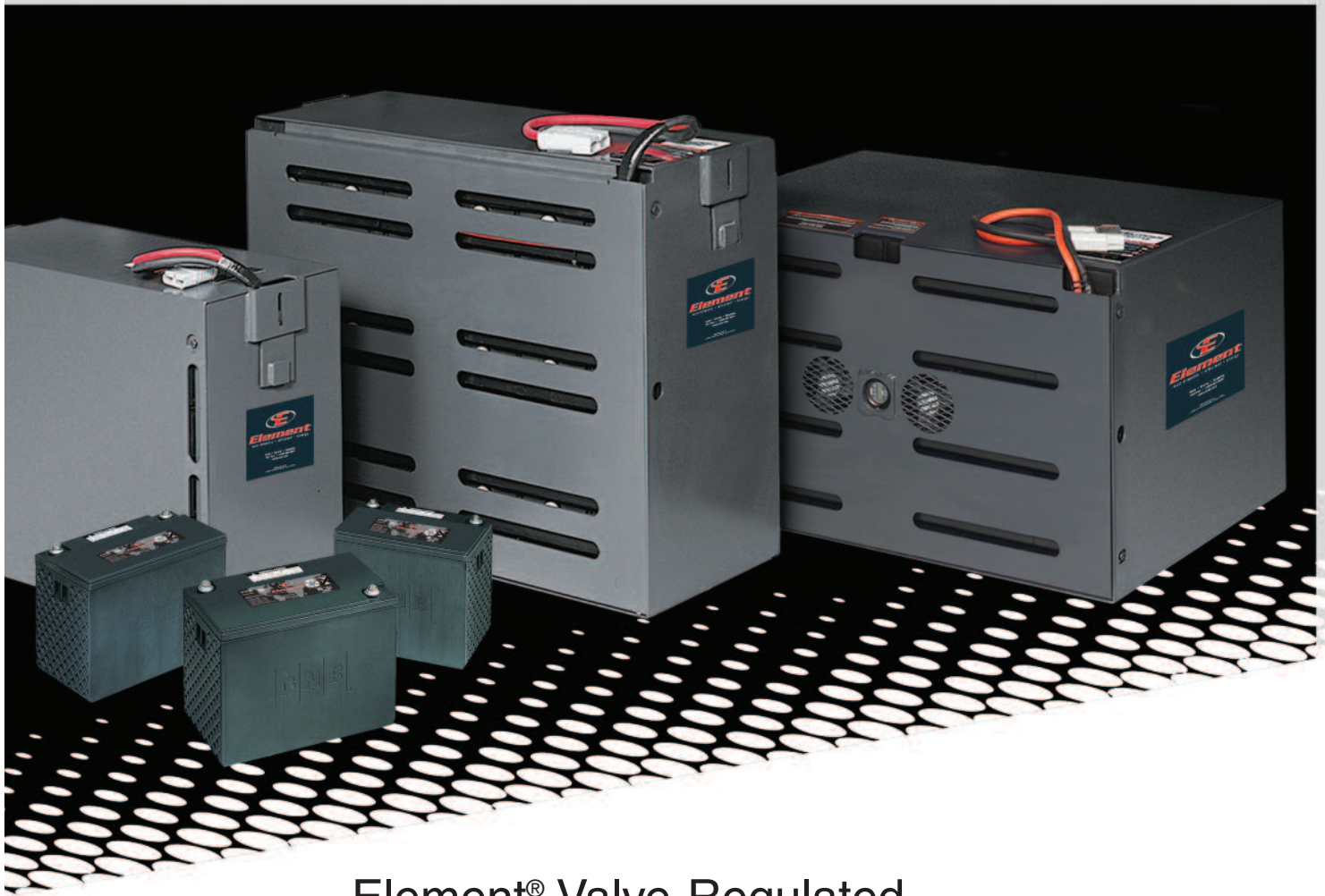
Element ® Valve-Regulated Lead-Acid Batteries